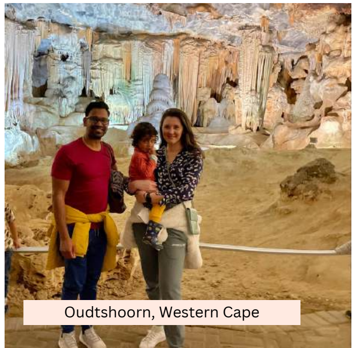
Oudtshoorn, Western Cape