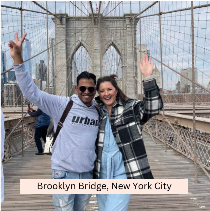
Brooklyn Bridge, New York City