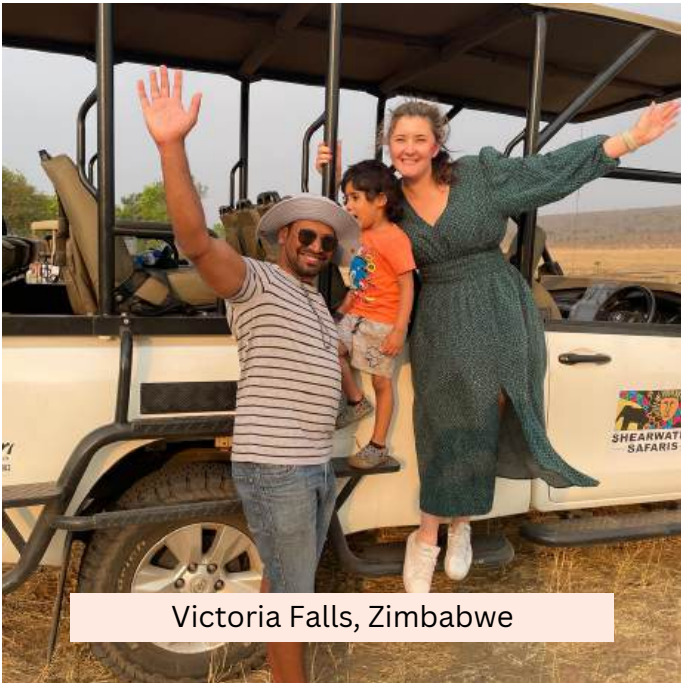
Victoria Falls, Zimbabwe