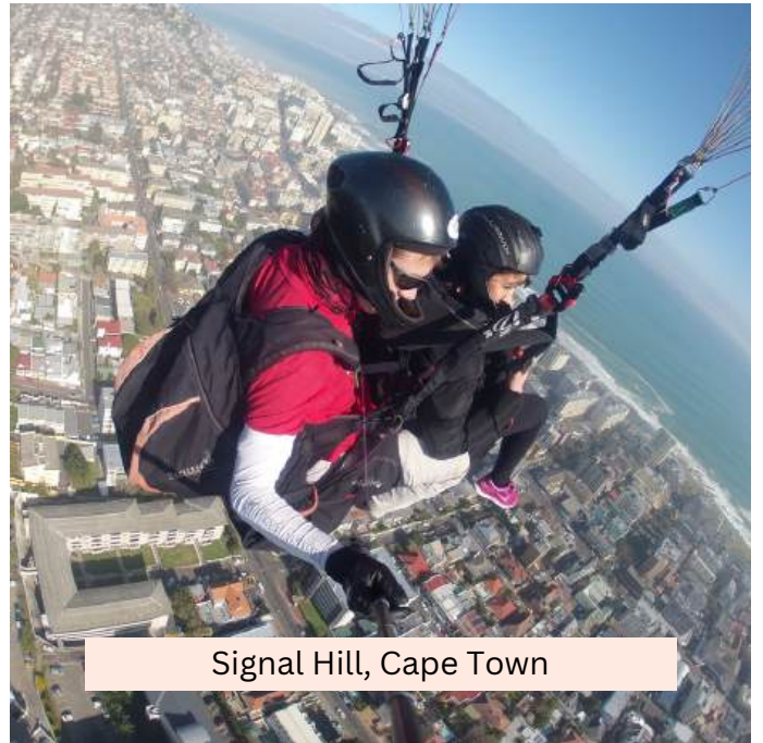
Signal Hill, Cape Town